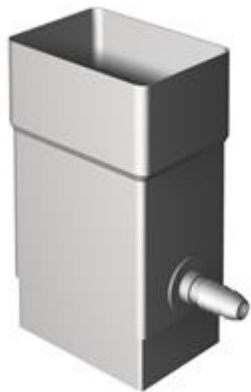
Figure 1. K7 x 10 water collector