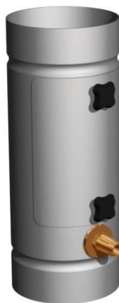
Figure 2. P10 water collector