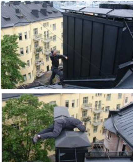
Figure 1. Before