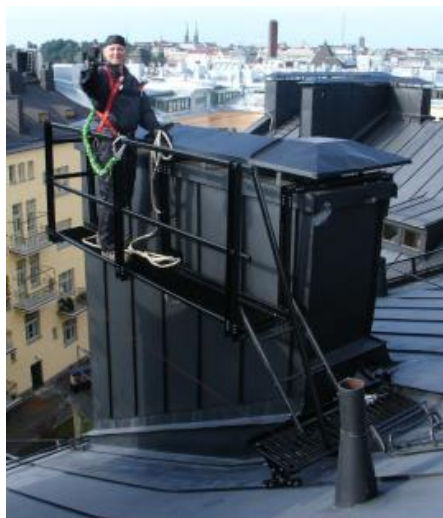
Figure 2. After