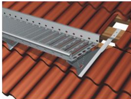
Figure 2. Tile roof